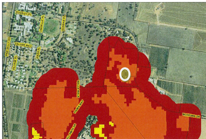
The site is in Bush fire prone land