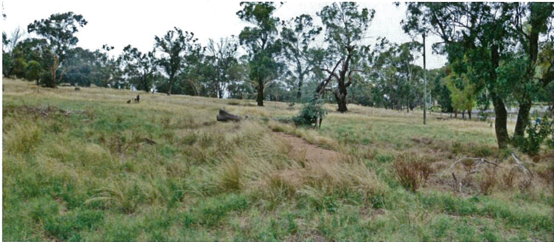
View of site from centre looking south