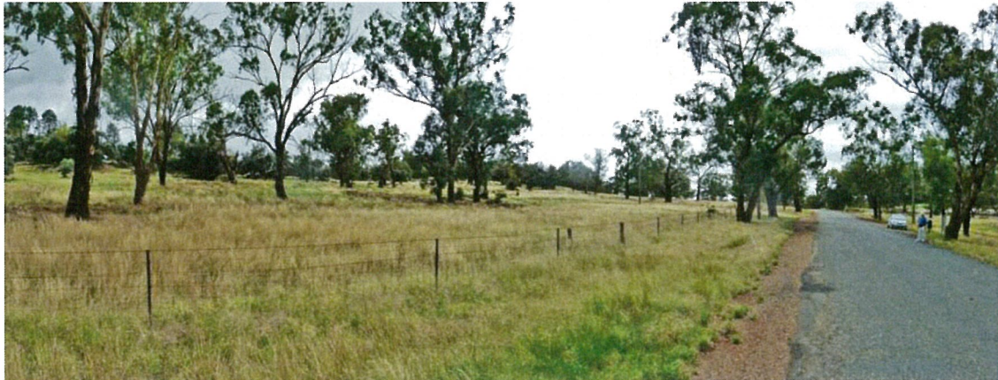
View of site from north west looking south east over site with Nathan Cobb Drive on right.