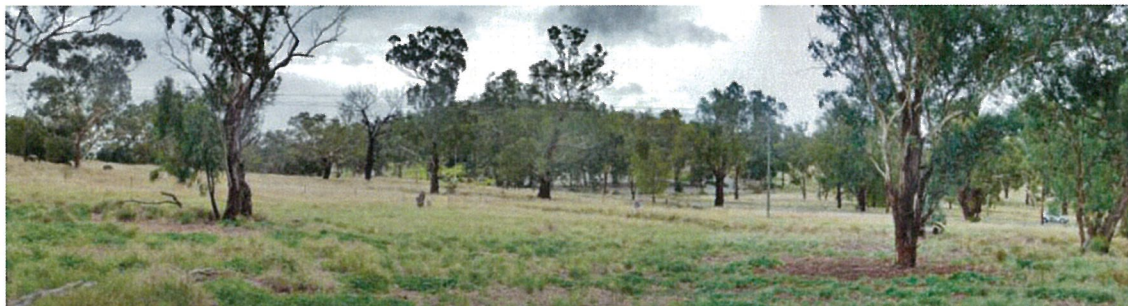
View of site from north east corner looking south west