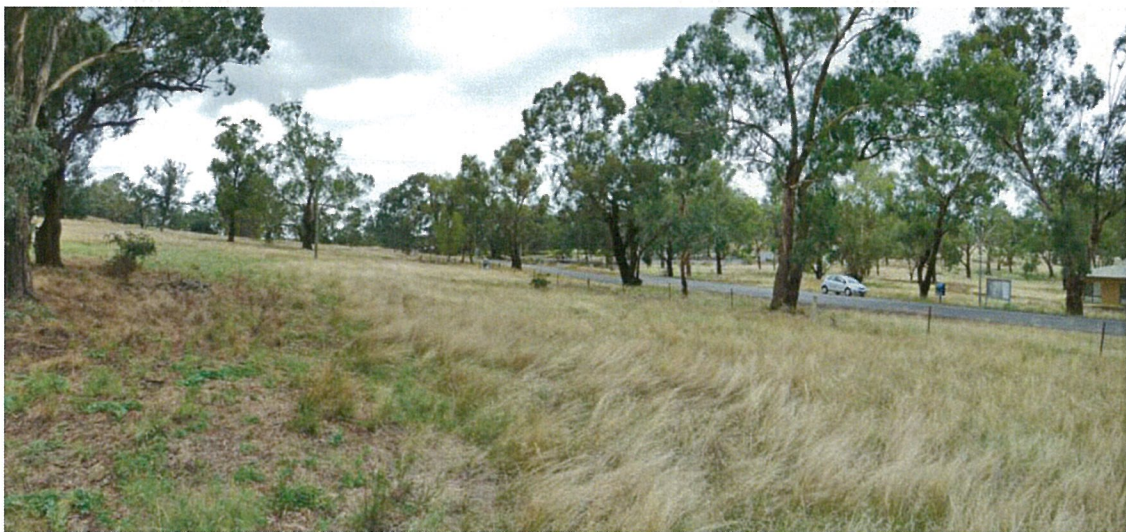
View of site from north looking south