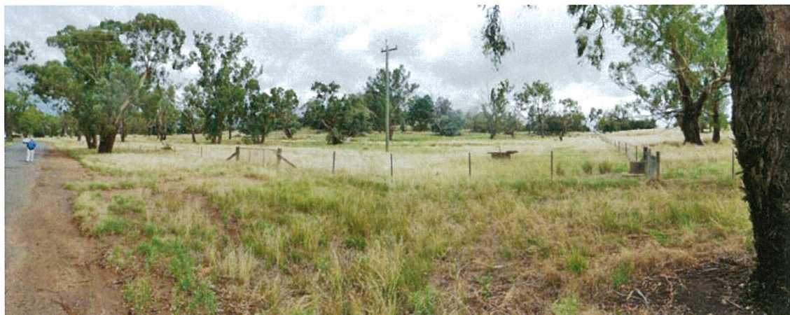
View of site from south west corner looking north east