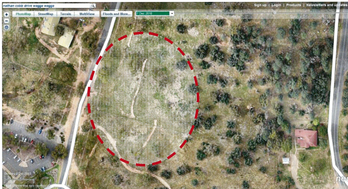
Ariel view of site 2